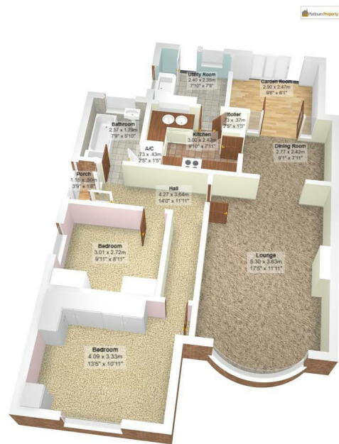
Ground Floor All measurements are approximate and for display purposes only

Please contact our Stoke-on-Trent Office on 01782 392211 if you wish to arrange a viewing appointment for this property or require further information.