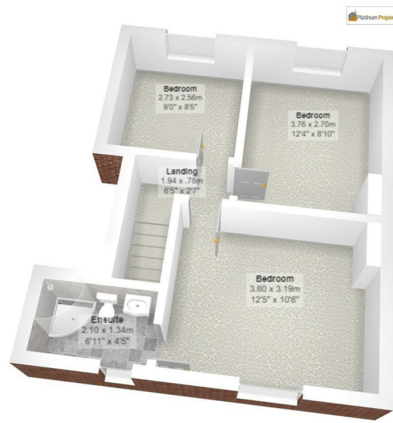
First Floor All measurements are approximate and for display purposes only