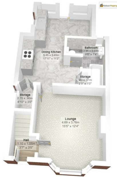
Ground Floor All measurements are approximate and for display purposes only