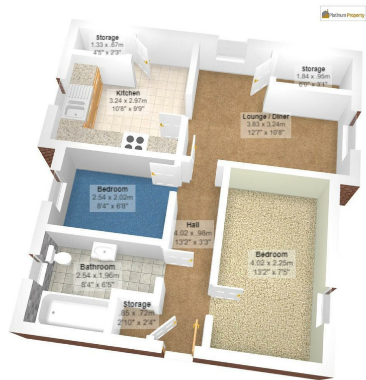
All measurements are approximate and for display purposes only

Please contact our Stoke-on-Trent Office on 01782 392211 if you wish to arrange a viewing appointment for this property or require further information.