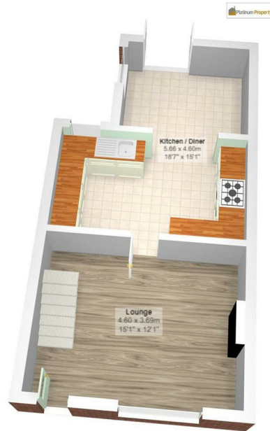
All measurements are approximate and for display purposes only