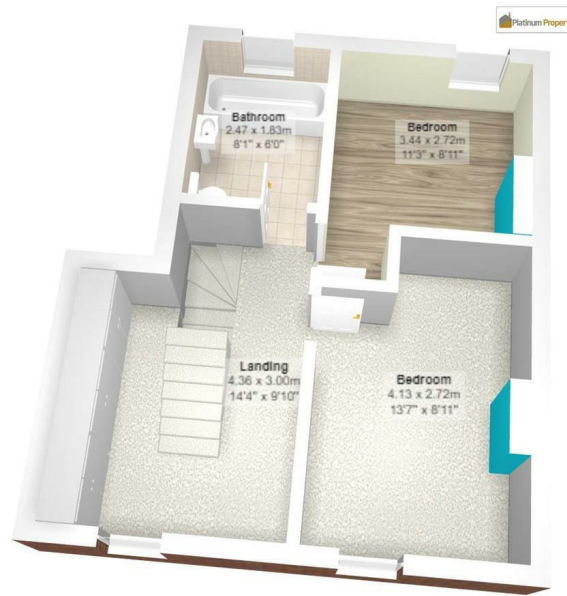
All measurements are approximate and for display purposes only