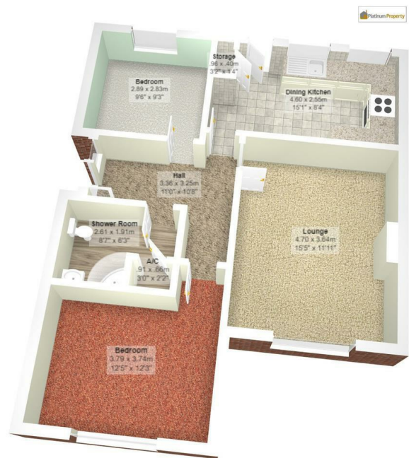
All measurements are approximate and for display purposes only

Please contact our Stoke-on-Trent Office on 01782 392211 if you wish to arrange a viewing appointment for this property or require further information.