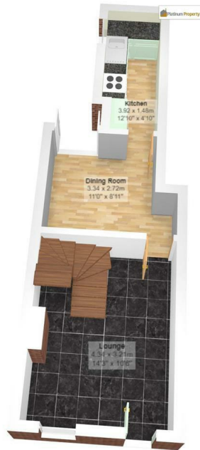
Ground Floor All measurements are approximate and for display purposes only