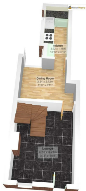
Ground Floor All measurements are approximate and for display purposes only