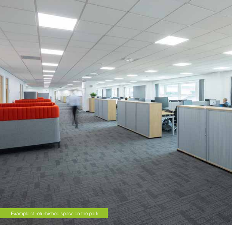
Example of refurbished space on the park