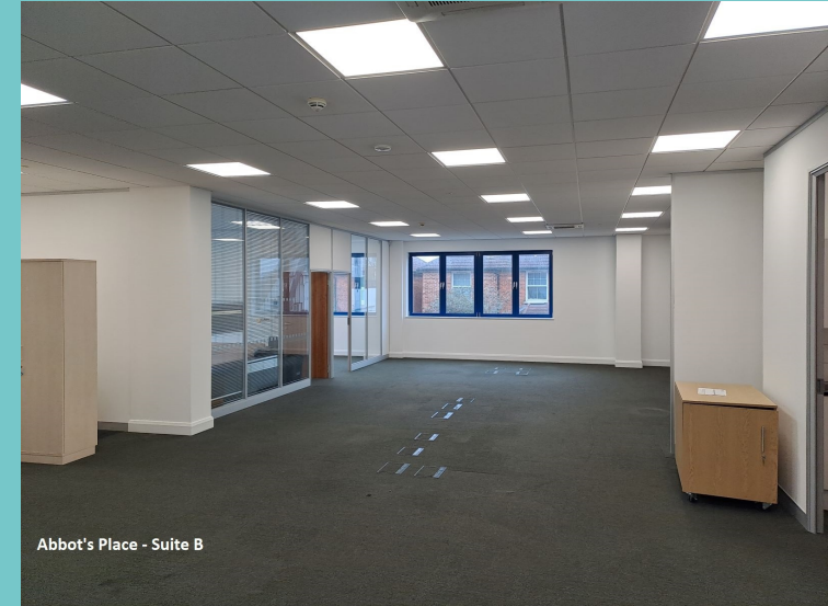
Abbot's Place - Suite B