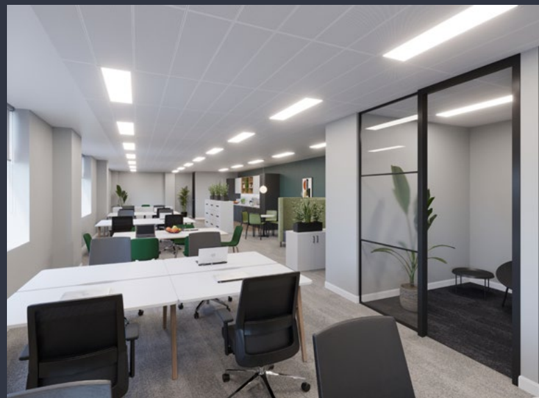
Open plan office and quiet room