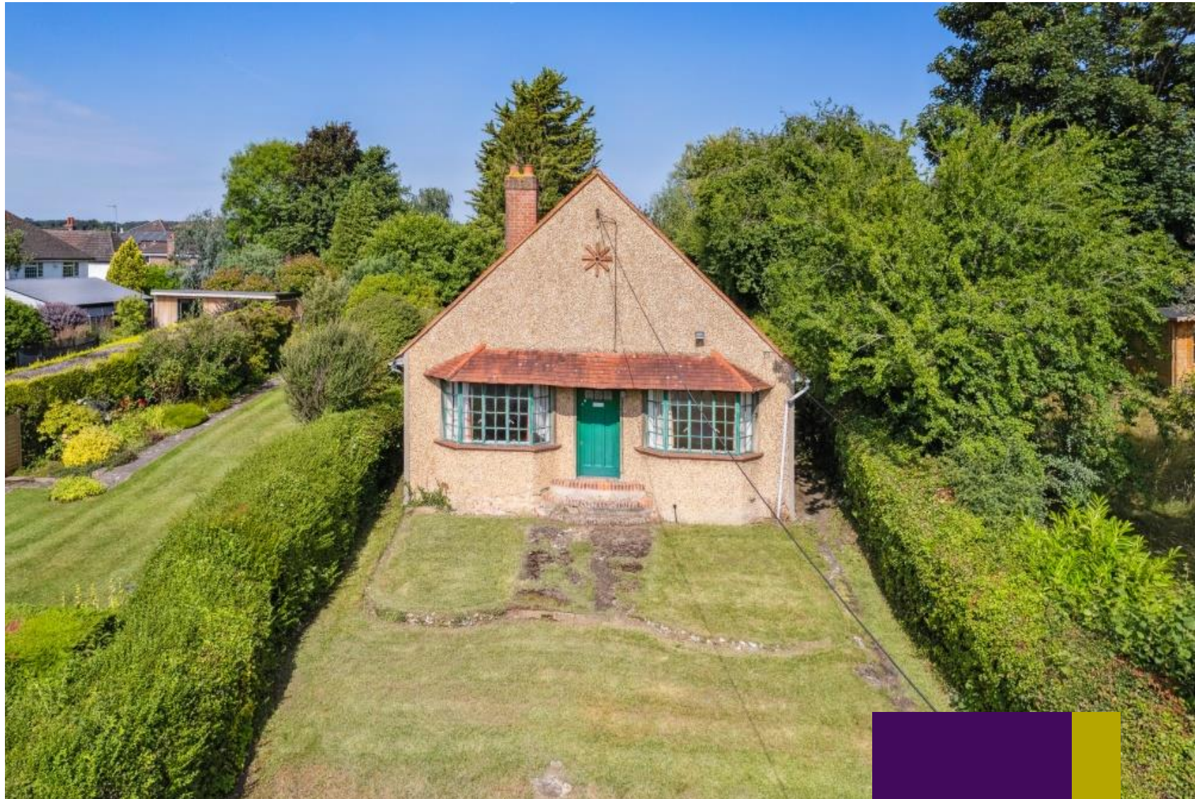
KINGS ROAD, CHALFONT ST. GILES