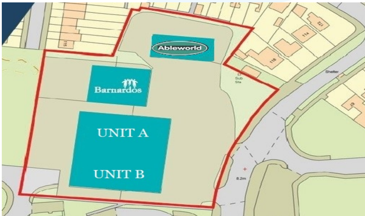
SITE PLAN: for guidance purposes only

Misrepresentation Act 1967: Duxburys Commercial, as agents for the vendor or, as the case may be, lessor (the "Vendor") and for themselves, give notice that: