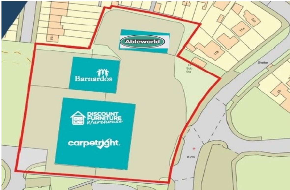
SITE PLAN: for guidance purposes only.

Misrepresentation Act 1967: Duxburys Commercial, as agents for the vendor or, as the case may be, lessor (the "Vendor") and for themselves, give notice that: