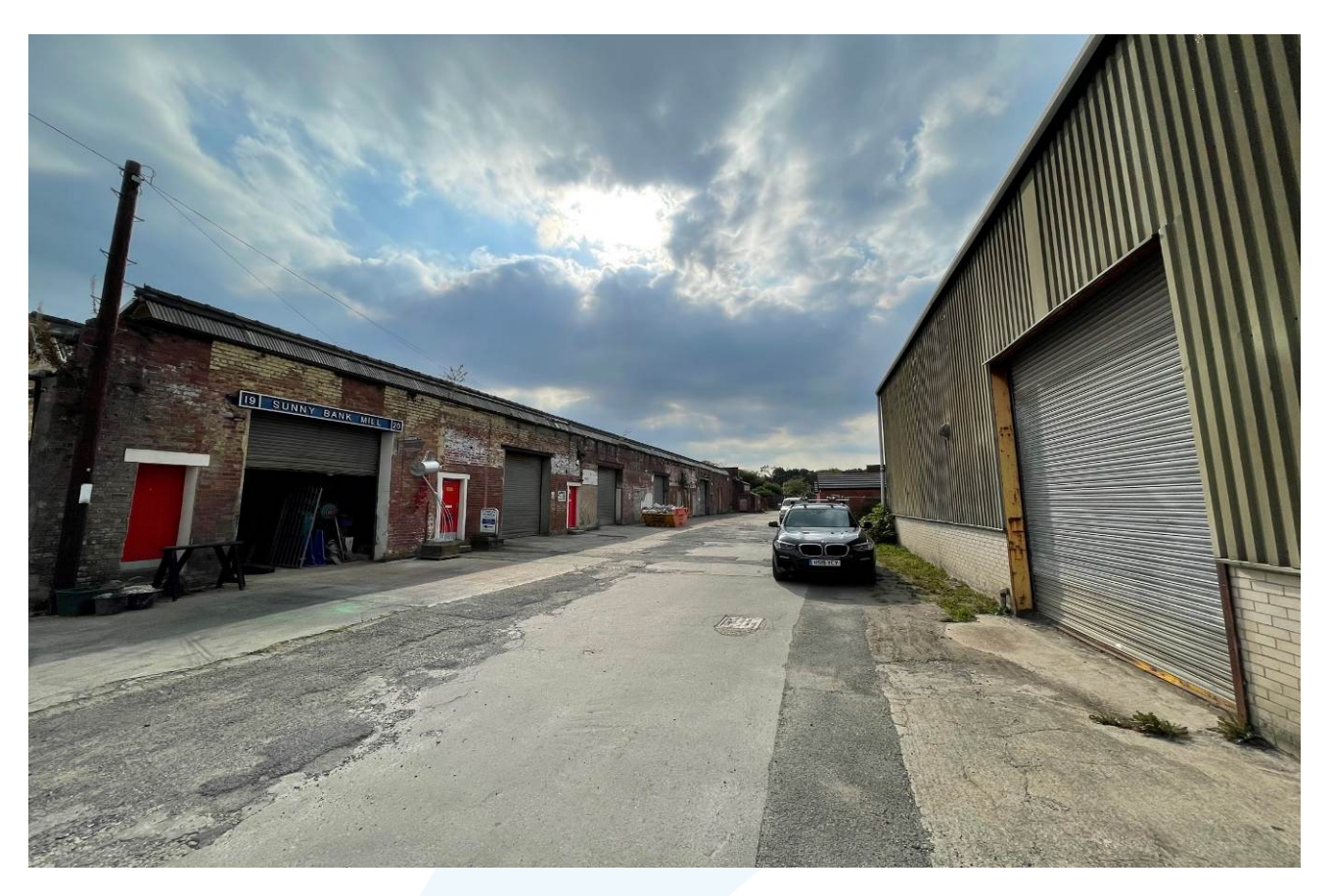
Entrance road into Sunnybank Mill site.