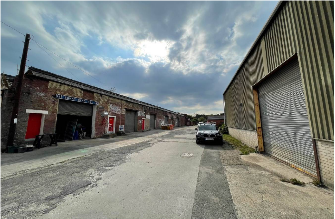
Entrance road into Sunnybank Mill site.