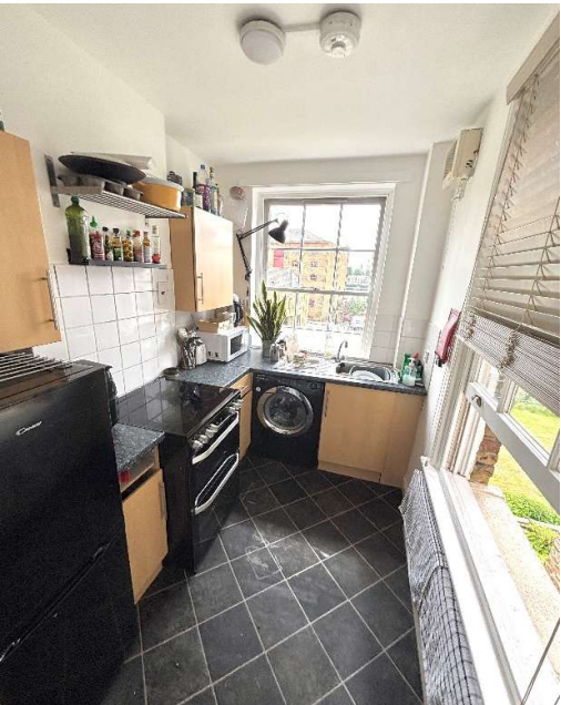
Typical 2 Bedroom Flat, Old Tower Buildings