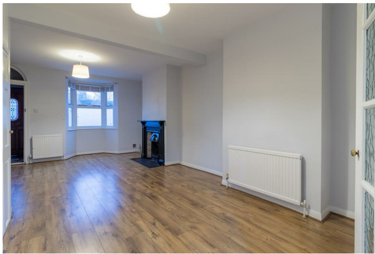
DINING AREA 10'2" x 9'9" (3.11 x 2.98)