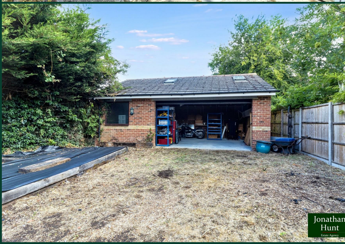
Jonathan Hunt Estate Agency