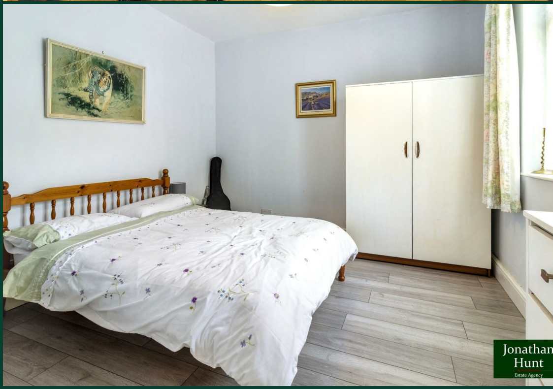
Jonathan Hunt Estate Agency