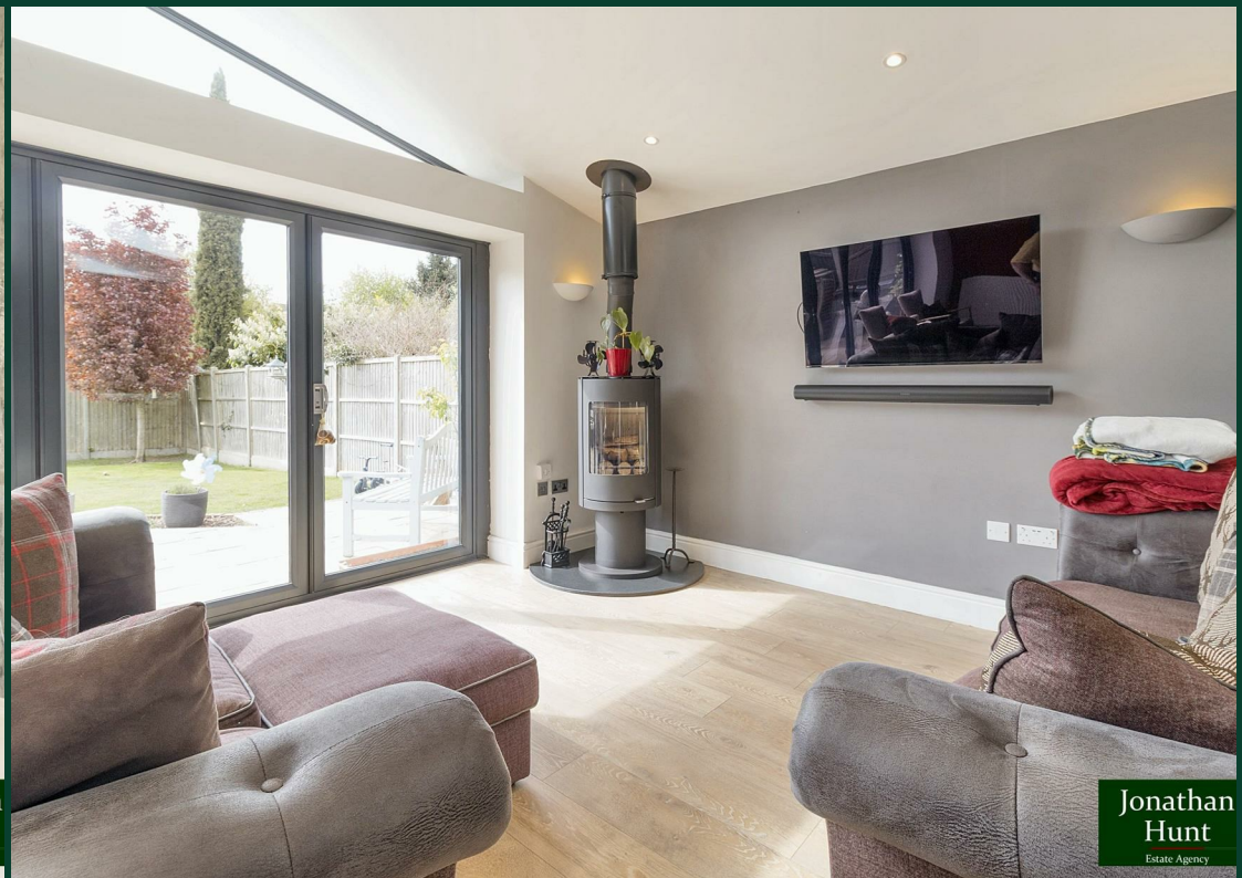
Jonathan Hunt Estate Agency