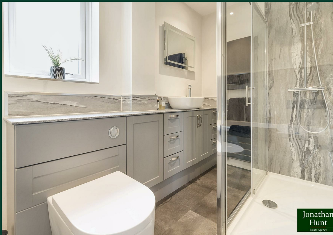
Jonathan Hunt Estate Agency