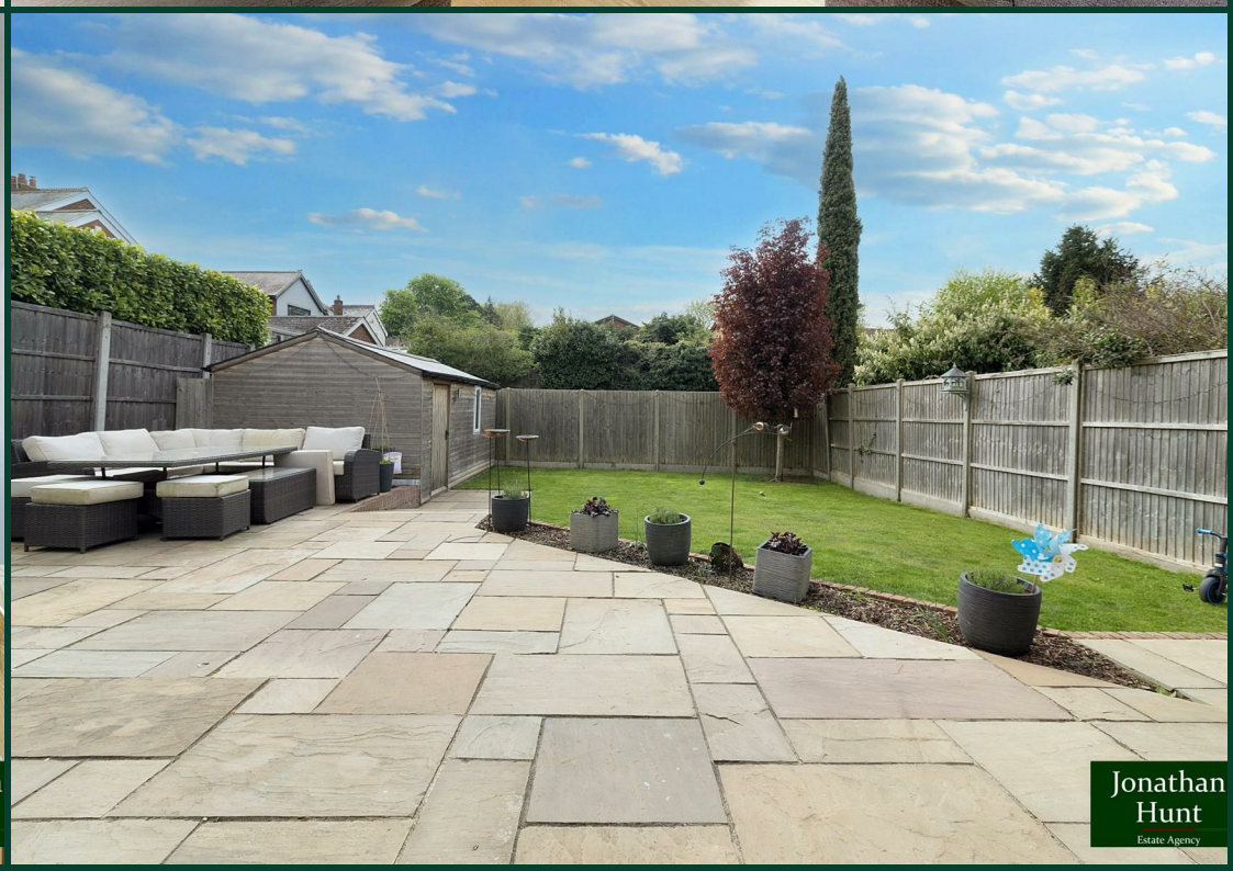
Jonathan Hunt Estate Agency