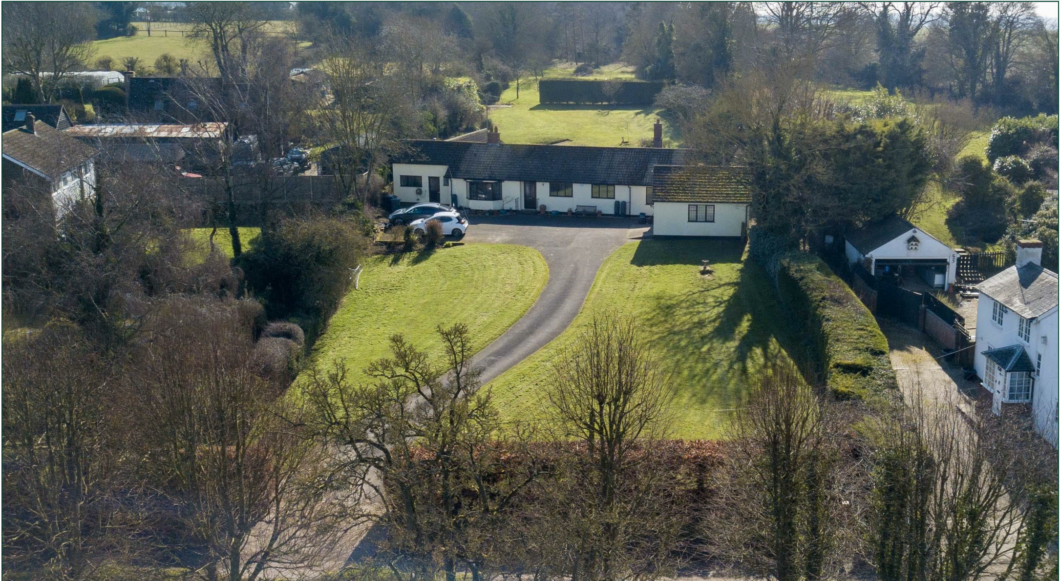
Brambles Anstey, Buntingford, SG9 ODL