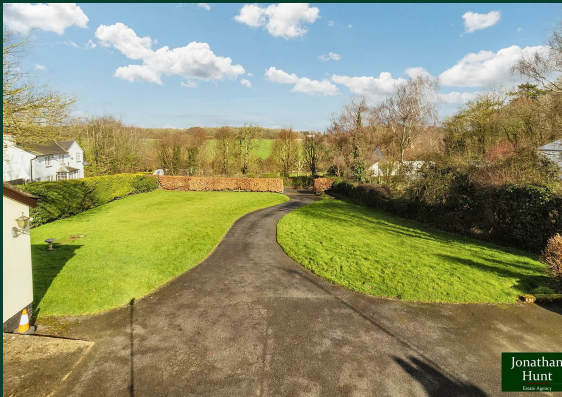
Jonathan Hunt Estate Agency