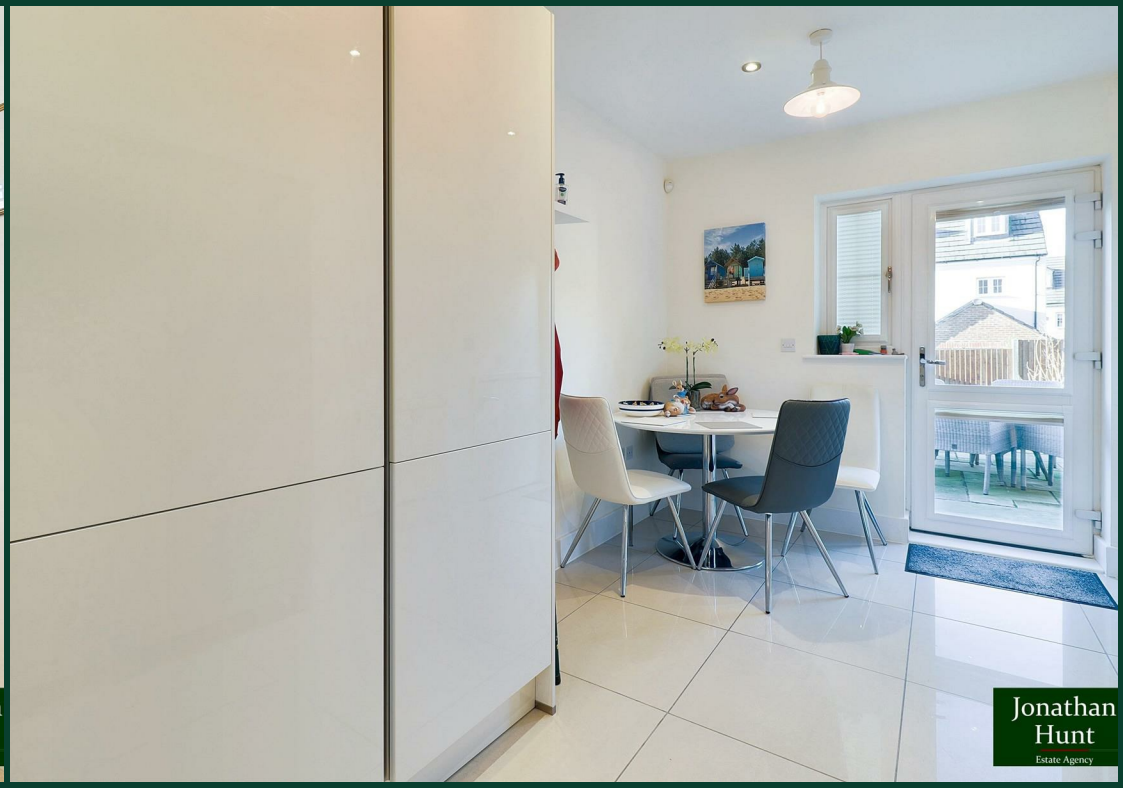
Jonathan Hunt Estate Agency