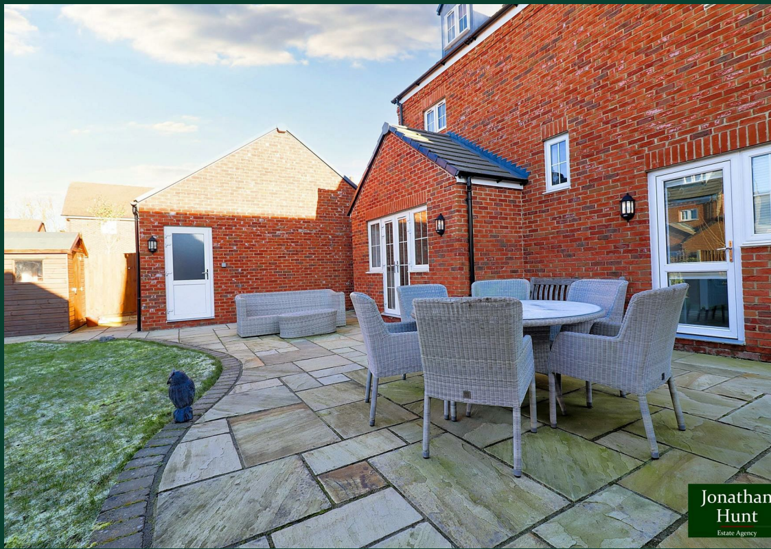
Jonathan Hunt Estate Agency