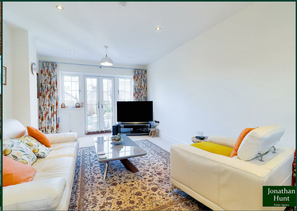
Jonathan Hunt Estate Agency