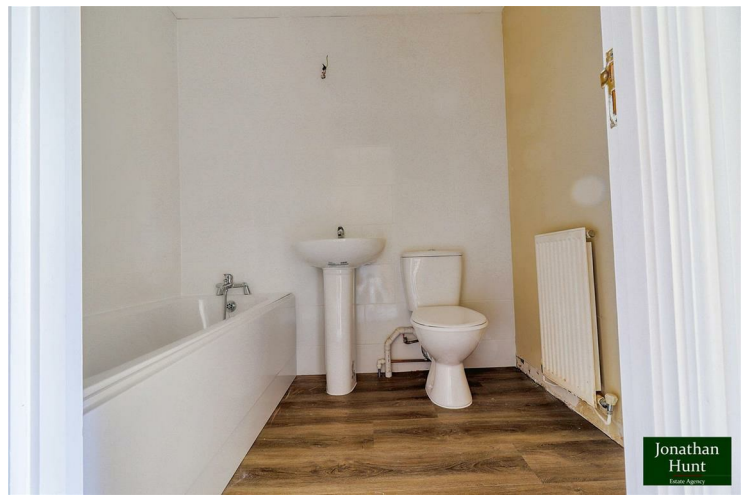
BATHROOM 5'10" x 7'0" (1.78 x 2.14)