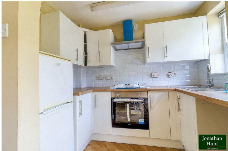
KITCHEN 5'4" x 8'3" (1.65 x 2.52)