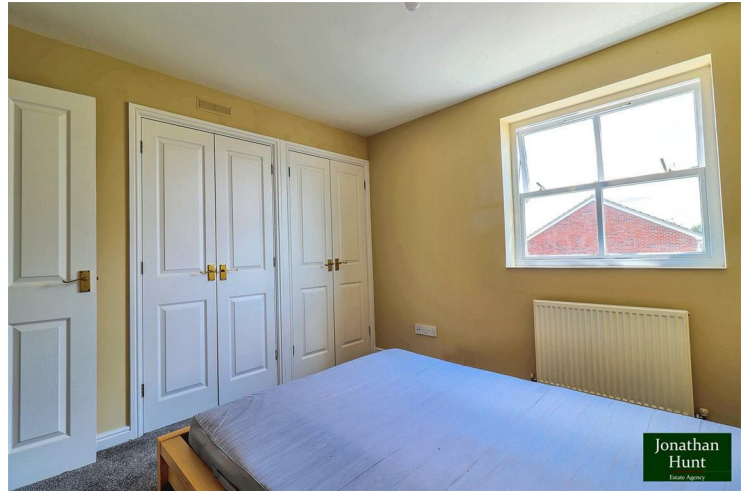
BEDROOM ONE 9'6" x 9'10" (2.90 x 3.02)