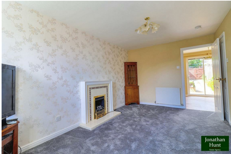
LOUNGE 9'5" x 15'9" (2.88 x 4.81)