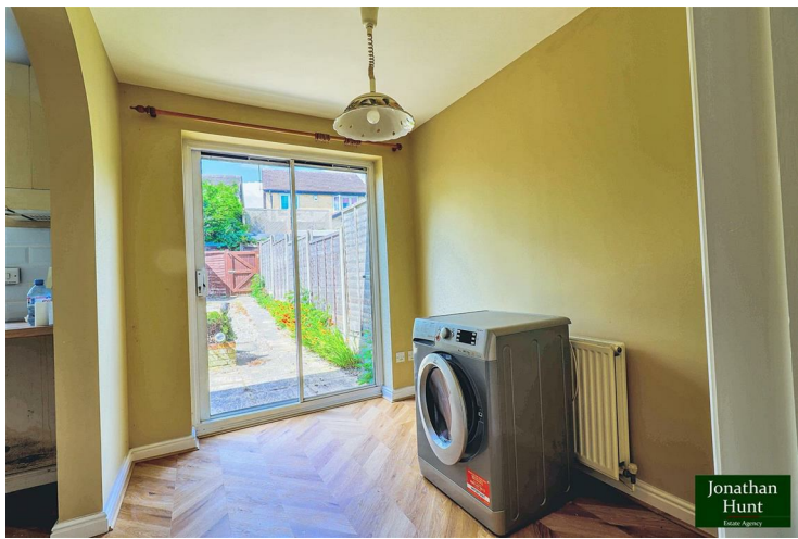
DINING AREA 6'10" x 8'2" (2.09 x 2.51)