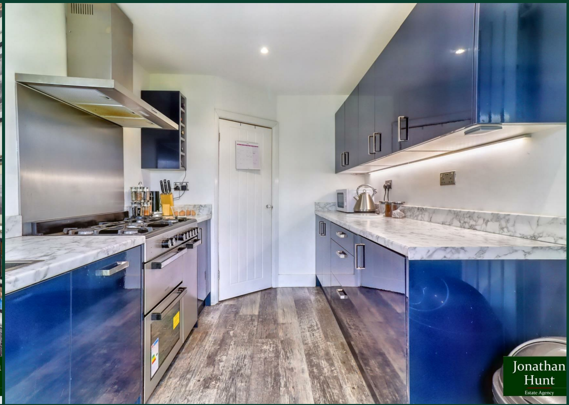
Jonathan Hunt Estate Agency