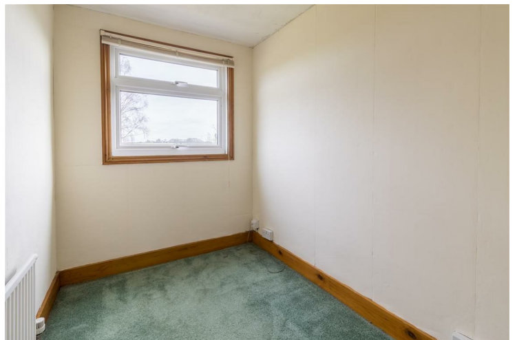
BEDROOM FOUR 7'10" x 6'6" (2.4 x 2)