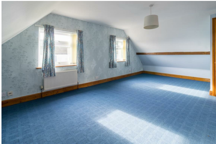
BEDROOM ONE 21'7" x 10'5" (6.6 x 3.2)