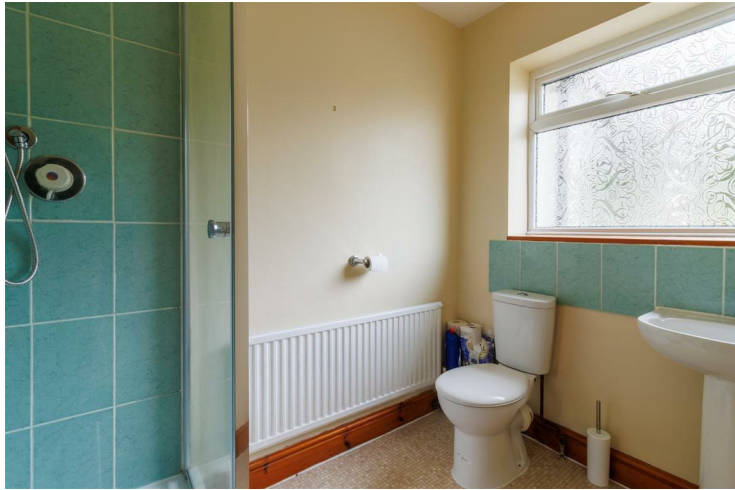
GROUND FLOOR SHOWER ROOM and WC 7'7" x 5'11" (2.32 x 1.81)