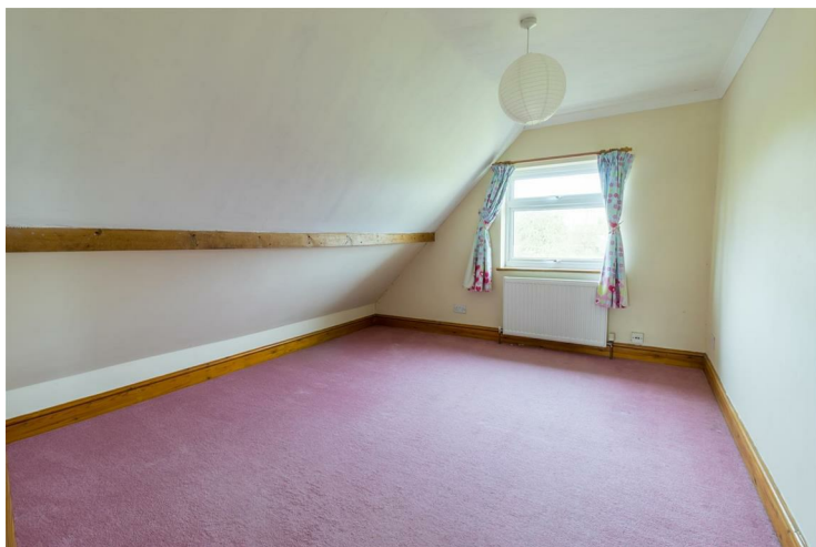
BEDROOM TWO 12'4" x 11'3" (3.77 x 3.43)