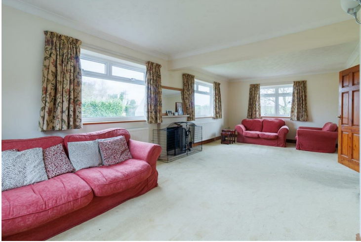
LOUNGE pic 2