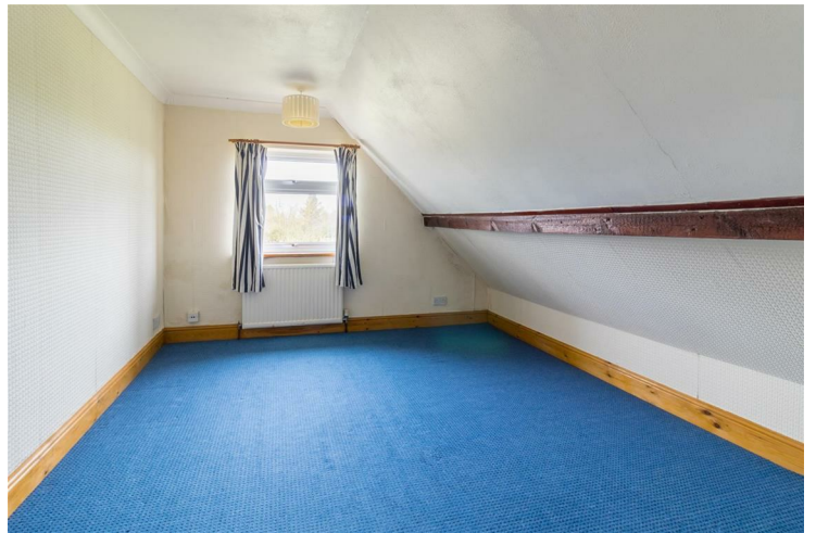
BEDROOM THREE 12'5" x 10'9" (3.8 x 3.29)