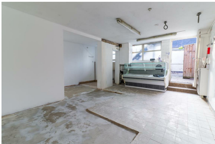
SHOP pic 4