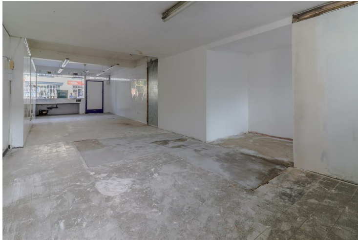
SHOP pic 1