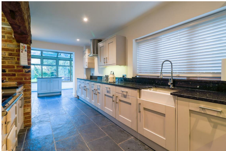
KITCHEN 18'9" x 11'2" (5.72 x 3.41)

This property boasts a beautifully designed bespoke shaker style kitchen, providing both style and functionality. The shaker style is characterized by its clean lines and minimalist design, creating a timeless and classic look that will stand the test of time.