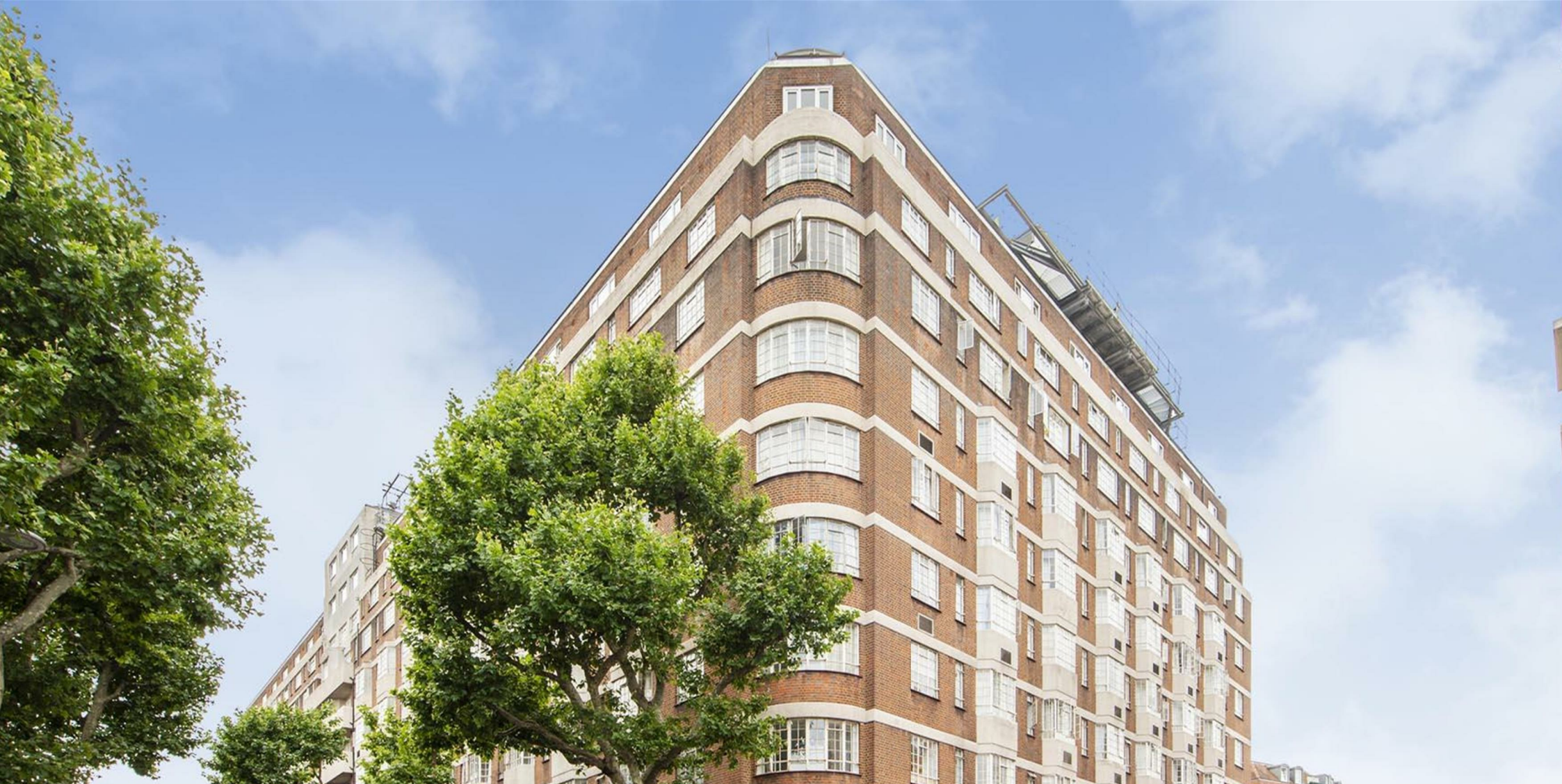
Chelsea Cloisters, Chelsea London SW3