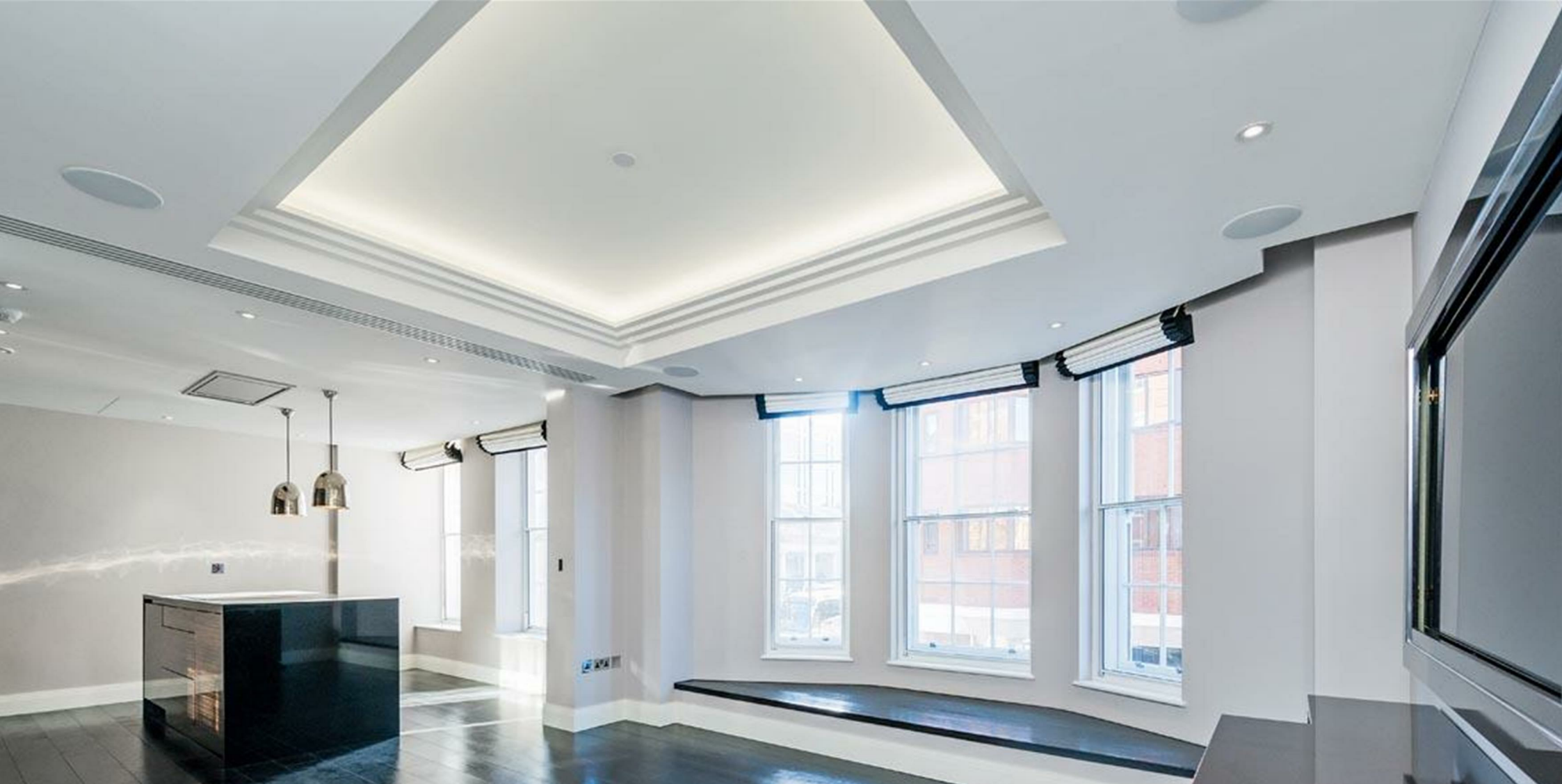
Chantrey House, Belgravia London SW1W