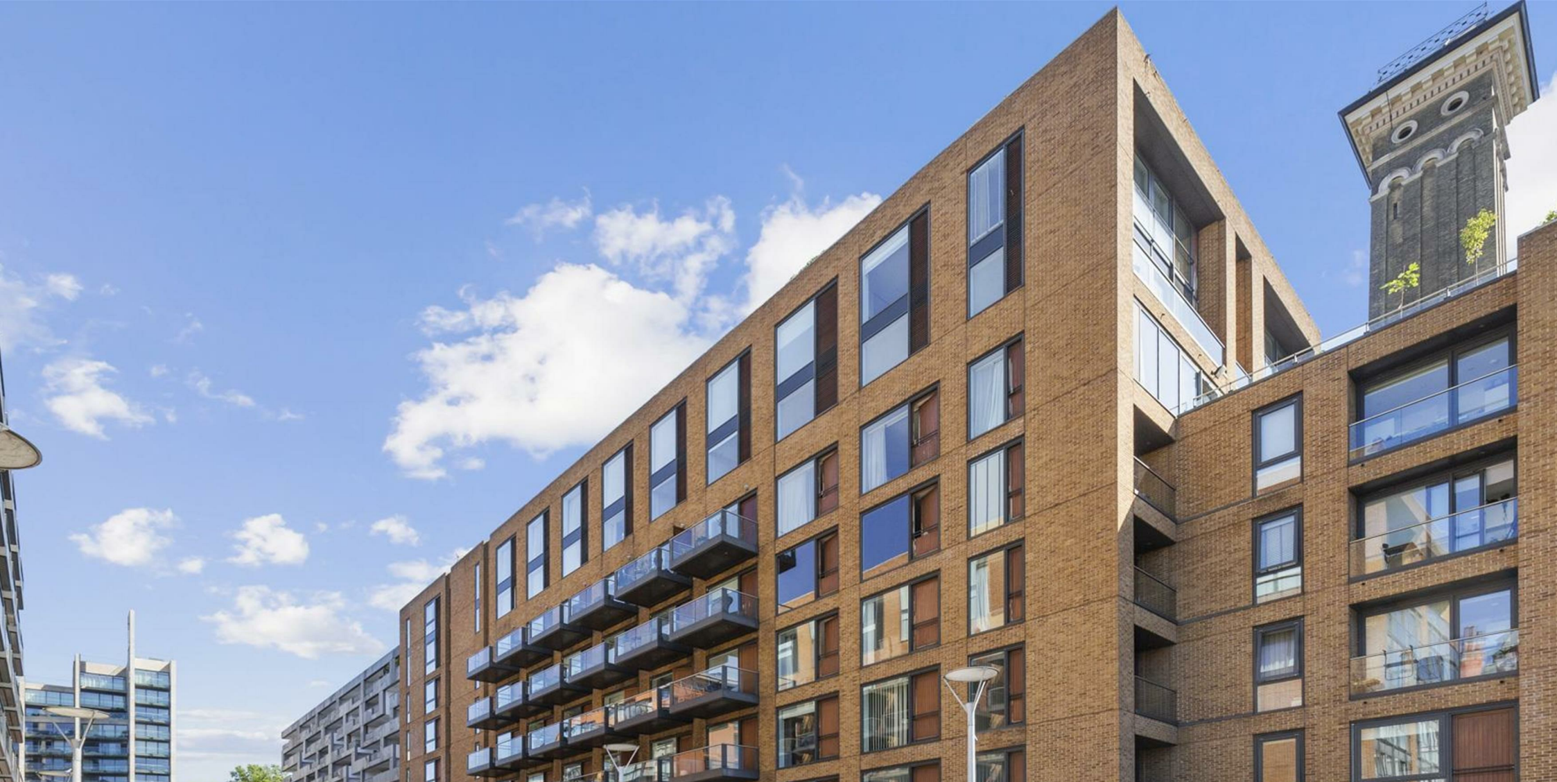
Cubitt Building, 10 Gatliff Road London SW1W