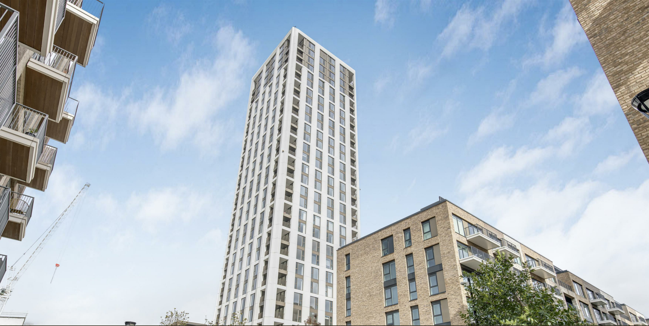
Kings Tower, Chelsea Creek London SW6