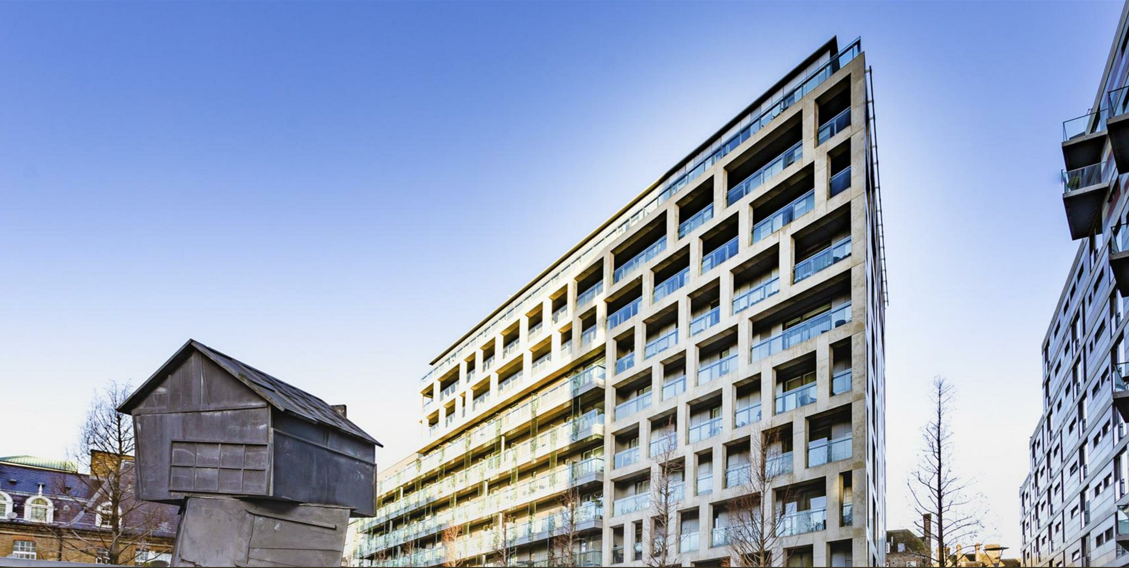
Moore House, 2 Gatliff Road London SW1W