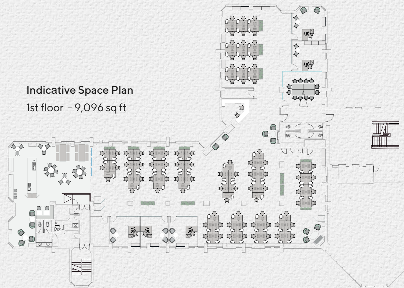
Indicative Space Plan 1st floor - 9,096 sq ft

Contact our agents to request floorplans and to discuss flexible leasing options.