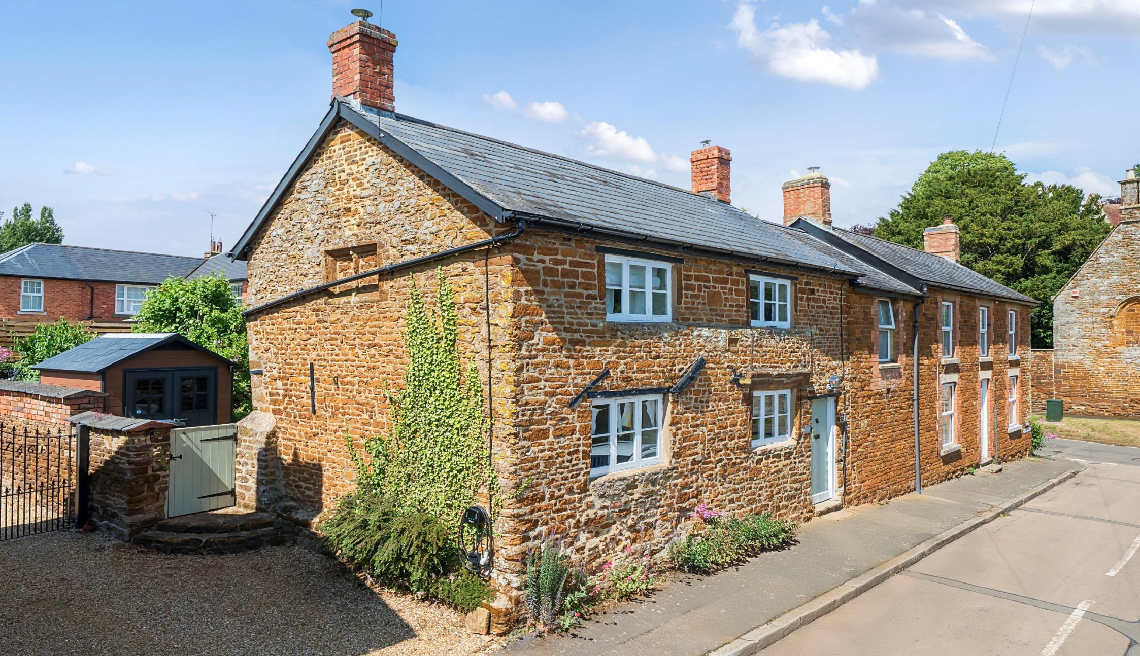
The Cottage, King Street, Maidford, Northamptonshire, NN12 8HQ