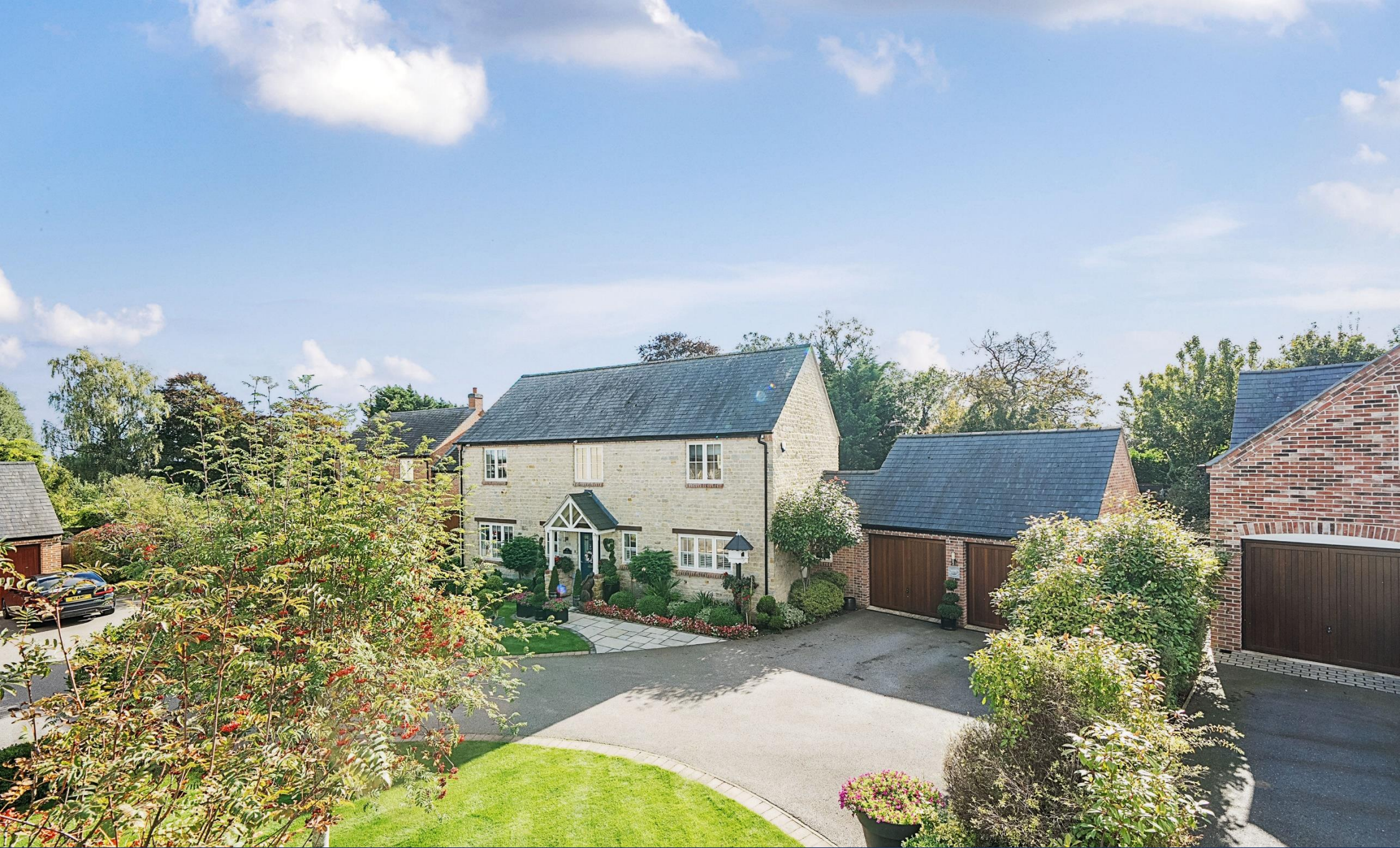
Beech House, 21 Mansion Gardens, Potterspury, NN12 7FD