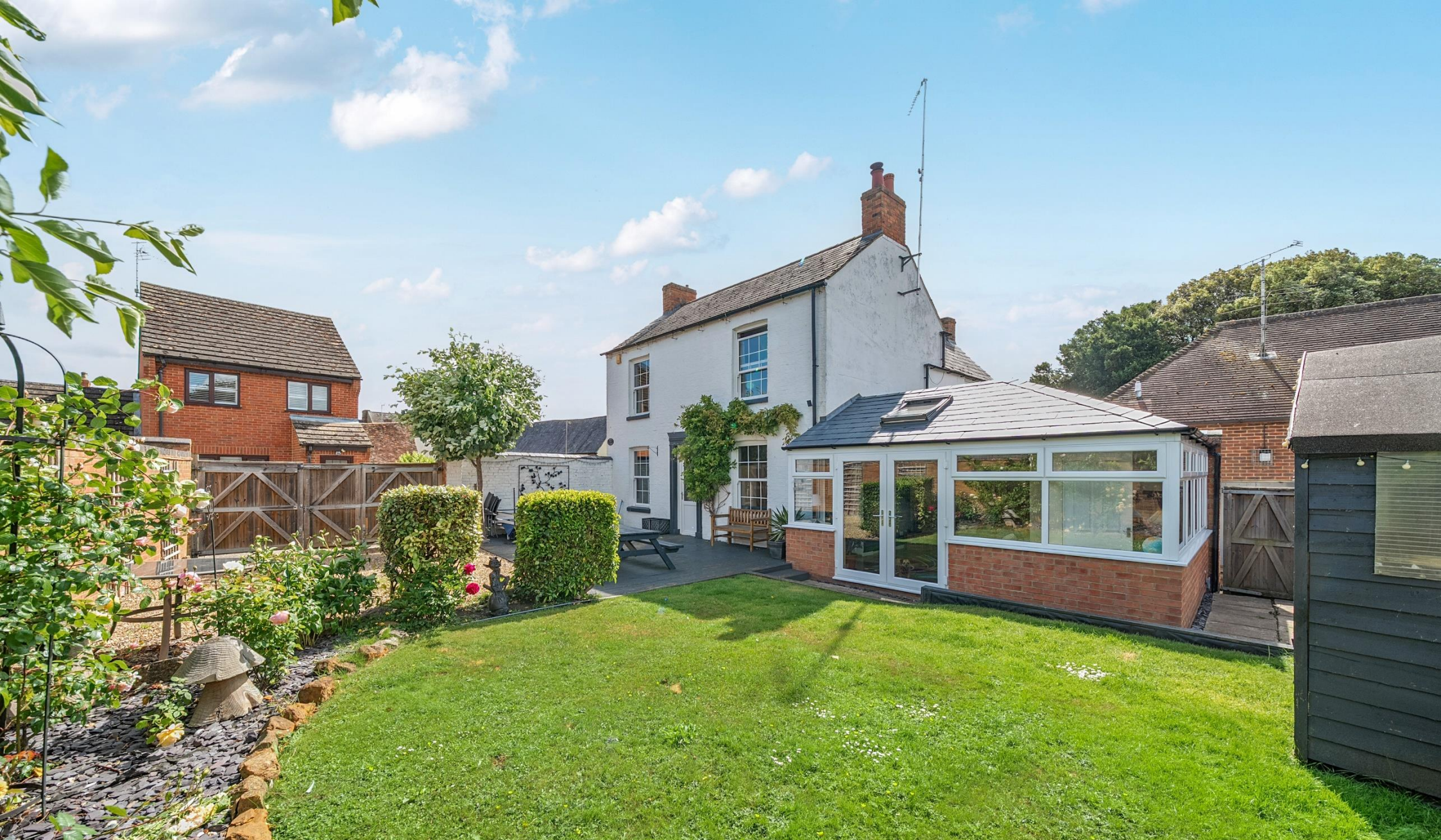
Rose Cottage, Browns Yard, Towcester, Northamptonshire, NN12 6SY