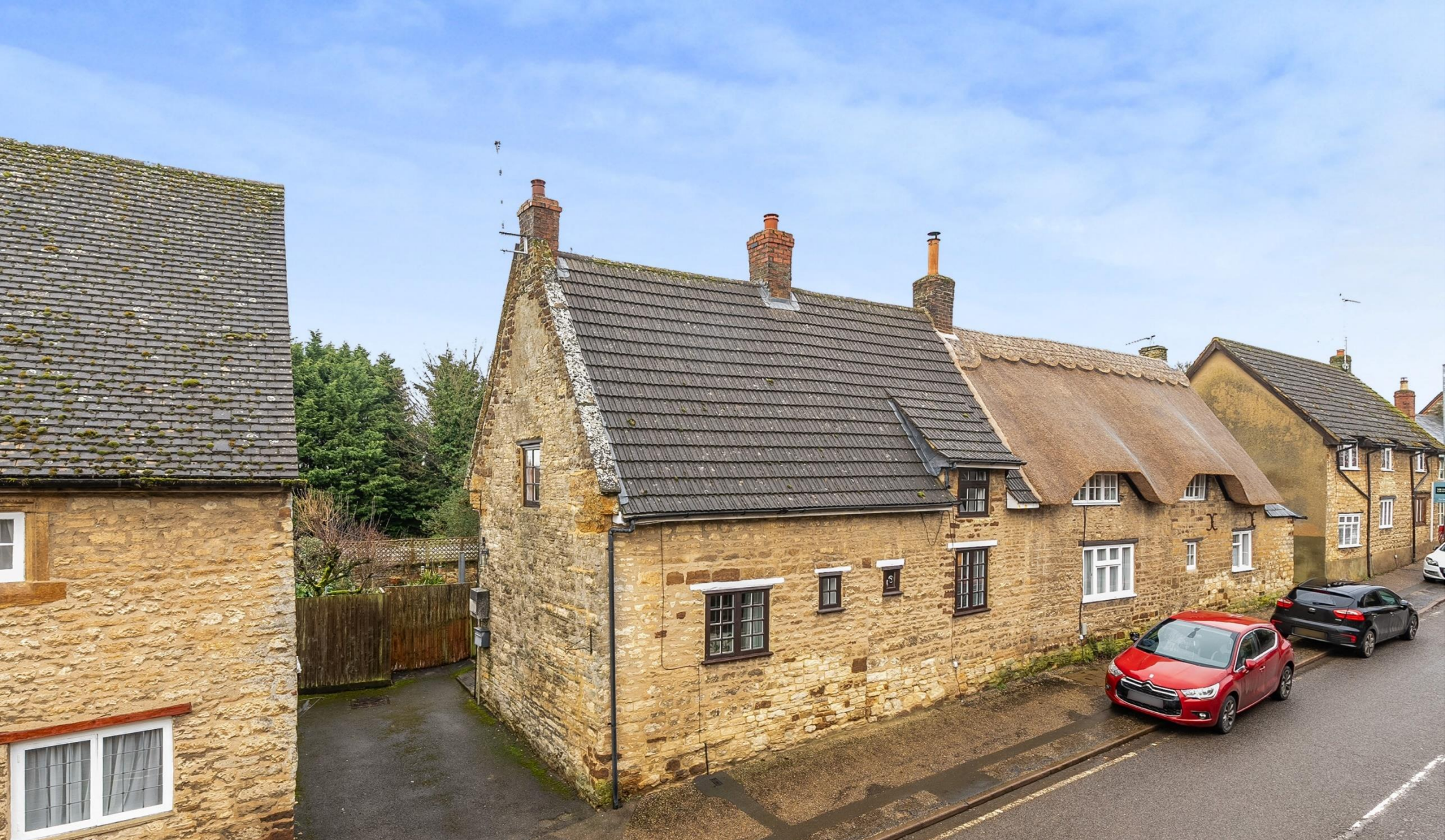
Oakbeams, 42 High Street, Blisworth, Northamptonshire, NN7 3BJ