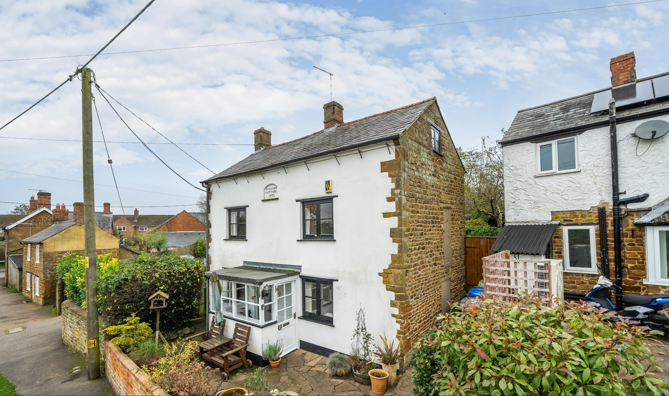
Quinbury Cottage, 35 Quinbury End, Blakesley, Northamptonshire, NN12 8RF