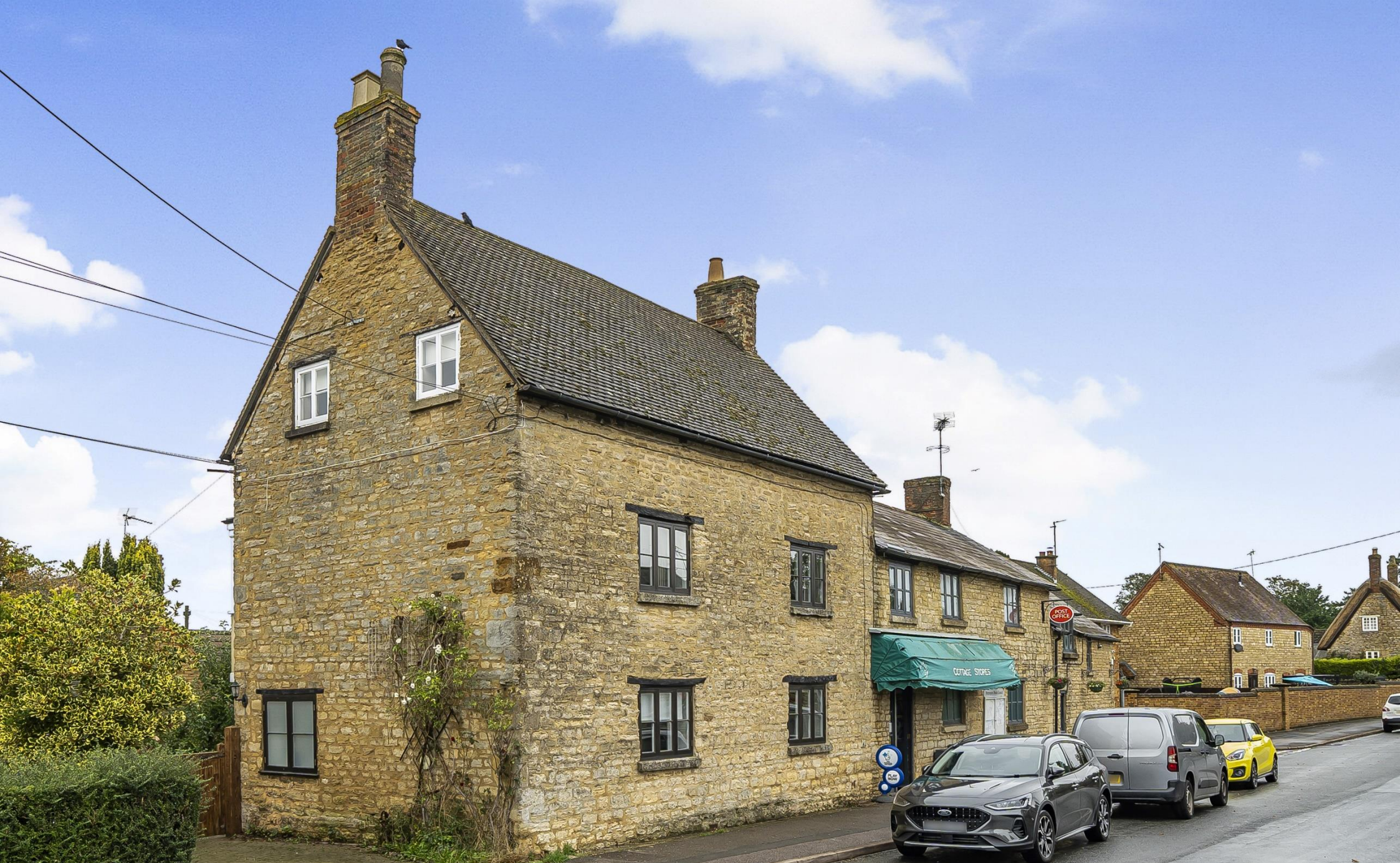
Woods Farmhouse, 100 High Street, Potterspury, Northamptonshire, NN12 7PQ