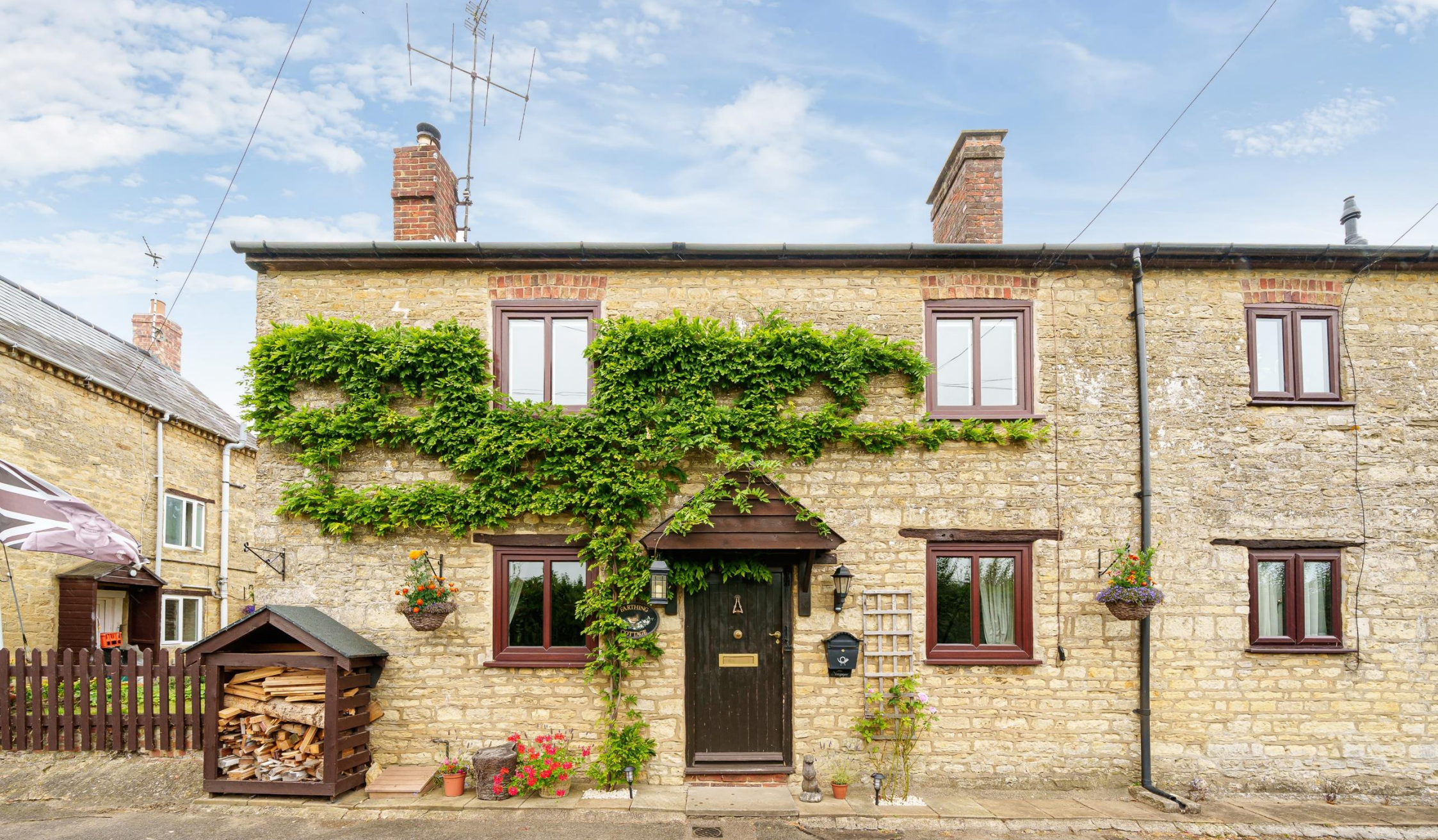
Farthing Cottage, 41 Lower Street, Pury End, Northamptonshire, NN12 7NS