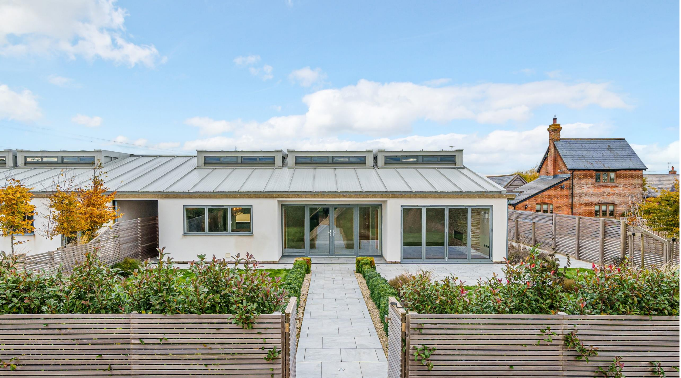
Oak Apple Barn, Hogshaw Farm Barns, Hogshaw, Buckinghamshire, MK18 3LA