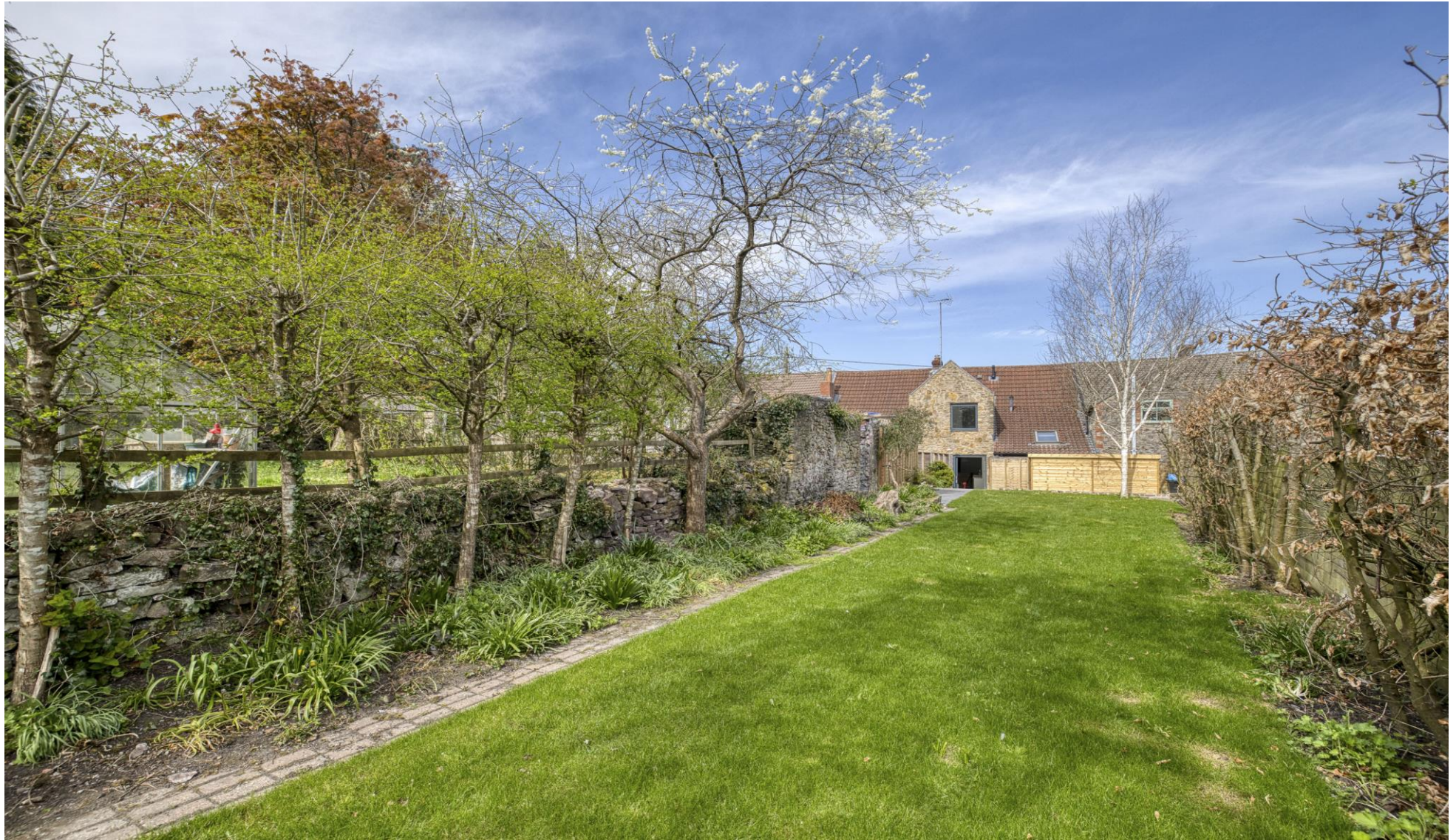
Rose Cottage, Stoke St. Michael