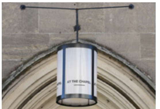
At The Chap