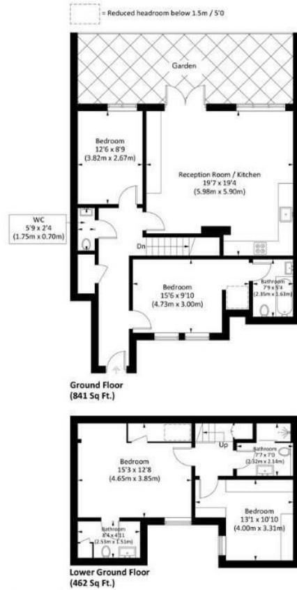
Illustration for identification purposes only, measurements are approximate, not to scale. FloorplansUsketch.com © 2024 (ID1107980)