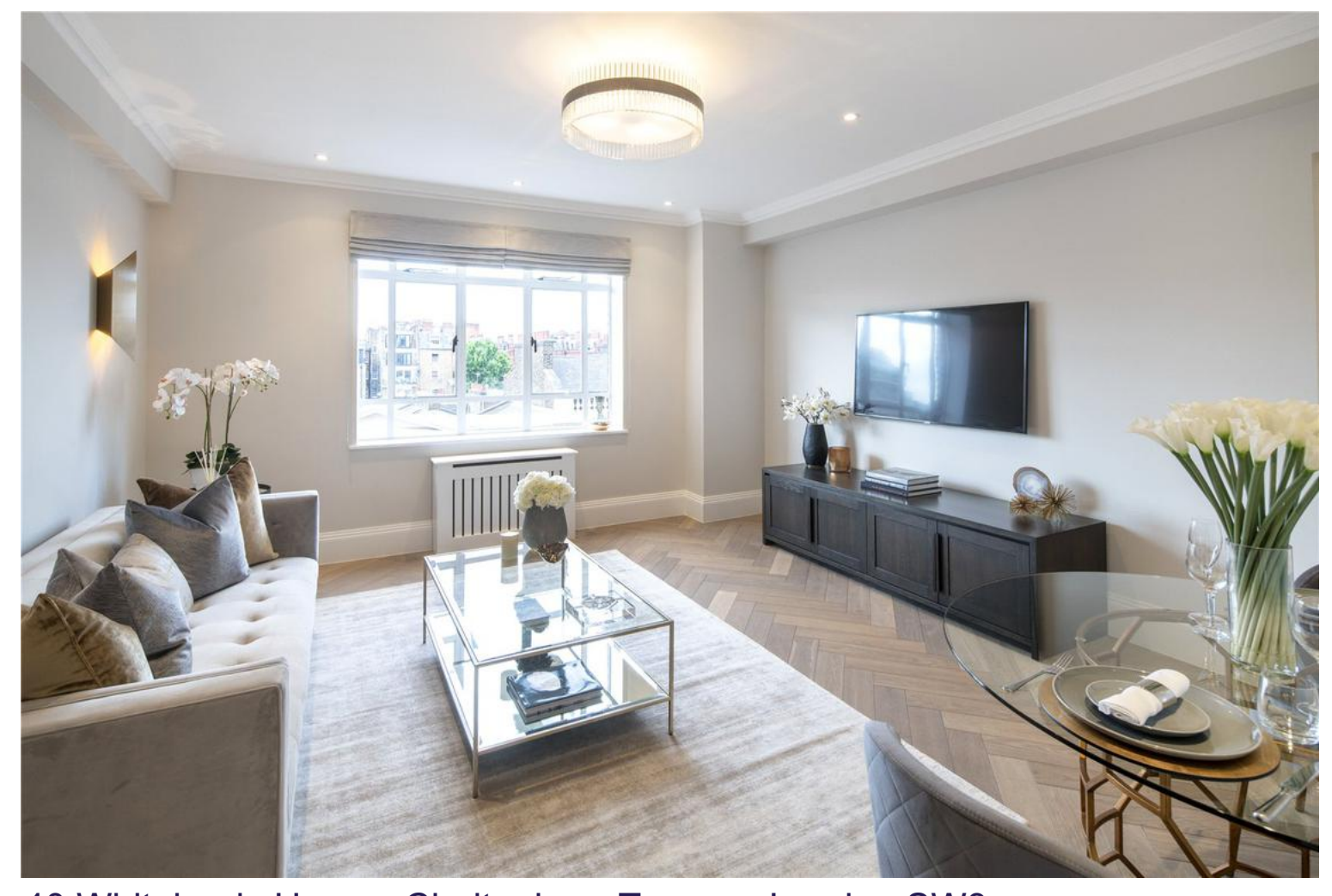
40 Whitelands House, Cheltenham Terrace, London SW3 4QY