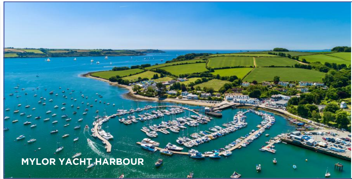
MYLOR YACHT HARBOUR