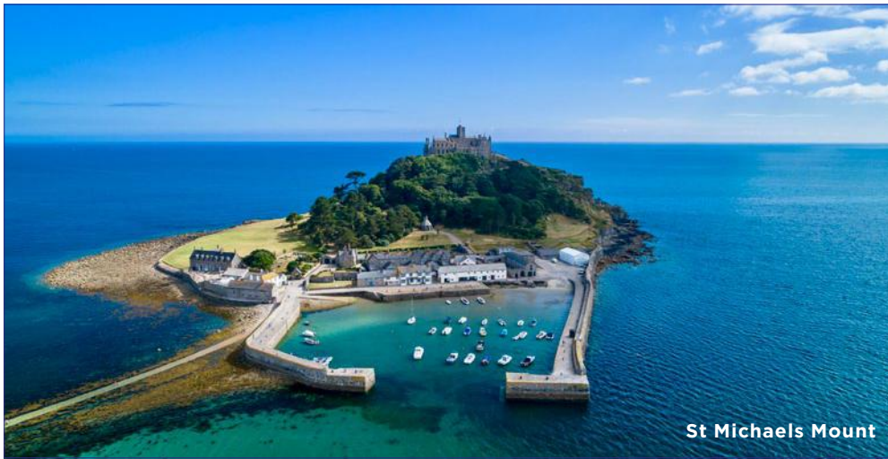
St Michael's Mount