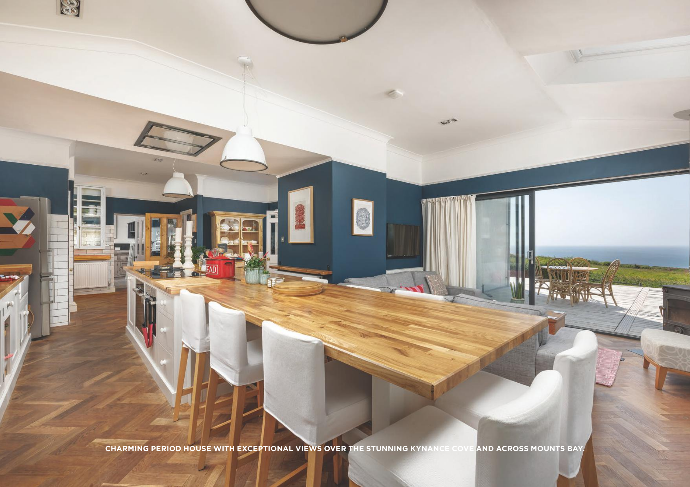
CHARMING PERIOD HOUSE WITH EXCEPTIONAL VIEWS OVER THE STUNNING KYNANCE COVE AND ACROSS MOUNTS BAY.