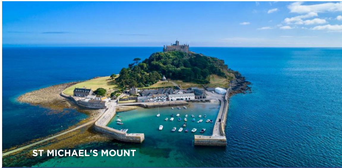
ST MICHAEL'S MOUNT