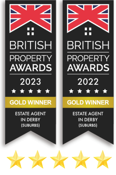
200+ 5 star Google Reviews

There is a small primary school in Church Broughton and leads through to John Port Spencer Academy in Etwall.